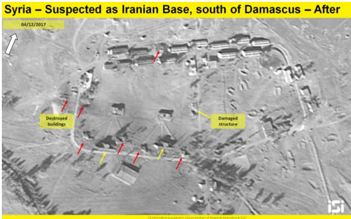
Satellite image following the reported Israeli air strike.

Indeed the military compound is of vital geostrategic importance. The burgeoning base is located at Damascus' immediate doorstep. Thus, once, –or if– completed, it could give Tehran an important leverage on the Syrian capital. This is of particular importance for some reasons: