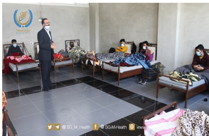
Visit of the "Minister" of Health (HTS) at the Jisr al-Shoghur Quarantine Centre.

(source : " Coronavirus and The Salvation Government – Hayat Tahrir al-Sham ", Jihadologie , May 8, 2020)