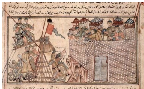
Engraving of the Siege of Kaffa : the first bacteriological assault in the history of war.

The idea dates back to 1346, when the Tatars laid siege to the city of Kaffa, now Theodosia (Crimea). Decimated by the plague, the attacking troops are preparing to break camp. Before leaving, they catapult infected bodies over the fortifications. The spreading plague will be fatal to a third of the European population.