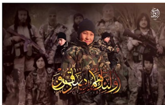
Propaganda video of the Uighur fighters of the Islamic State of the Wilayat al-Furat group (2017)

Facing Covid-19, the new chief of the Islamic State group, Amir al Mawla, keeps a vengeful line against Beijing 25 , but still without any operational capacity. As far as Al-Qaeda is concerned, apart from a video of the Islamic party of Turkestan, which presents the virus as a warning to the authorities in Beijing, nothing foreshadows the outbreak of hostilities.