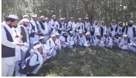
Release of thirty-six prisoners in the district of Chigazy (Faryab province) on May 11, 2020.

Ultimately, governance issues could become a marker of radical Islam. Let us recall that Al-Qaeda was rife in the governorate of Hadramaout (Yemen) in 2015, the year in which two cyclones struck 53 . The local populations still believe today that the group and its relays 54 were able to manage the situation as well, if not better, than the current authorities 55 . The same is true in the rural areas controlled by the katiba Macina (Mali), where the virtues of decentralization are practiced daily; each amir markaz , head of the center, is assisted by a military officer and a judge to oversee the management of daily affairs 56 .