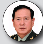
Rocket Force commander General Wei Fenghe