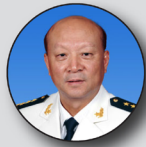
Navy commander Admiral Wu Shengli