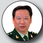
Army commander General Li Zuocheng