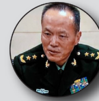
Strategic Support Force commander Lieutenant General Gao Jin