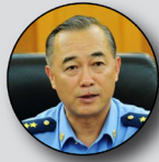
Air Force commander General Ma Xiaotian